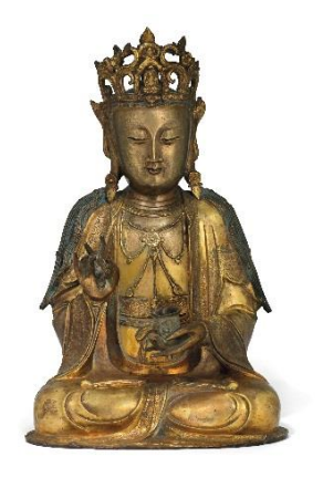
A FINELY CAST GILT-BRONZE FIGURE OF GUANYIN MING DYNASTY, 17^{TH} CENTURY 18 1/2 in. (47 cm.) high Estimates: £80,000-120,000

London – On 7 November 2017 Christie's Fine Chinese Ceramics & Works of Art auction will present a carefully-curated sale showcasing works of art spanning three millennia of Chinese art. Highlights include important archaic bronzes from the distinguished German collector Michael Michaels (1907-1986), exquisite imperial ceramics, fine jade carvings, huanghuali furniture, paintings from renowned modern Chinese artists, textiles and Buddhist art. The auction will take place during Asian Art Week in London and will be on view and open to the public from 3 to 6 November.