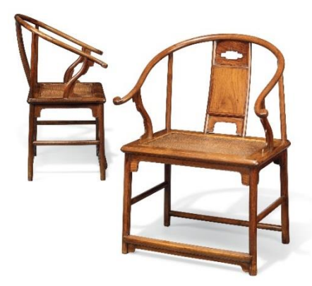
AN EXTREMELY RARE AND IMPORTANT PAIR OF HUANGHUALI HORSESHOE-BACK ARMCHAIRS, QUANYI MING DYNASTY, 17<sup>TH</sup> CENTURY Each 26 ¾ in. (68 cm.) wide, 21 in. (53.3 cm.) deep, 36 in. (91.5 cm.) high Estimate: £800,000 – 1,200,000